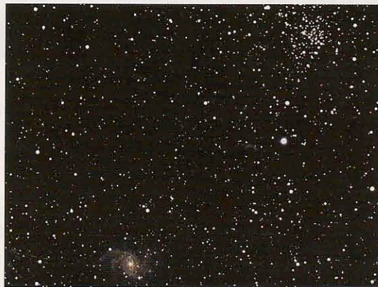
Open cluster NGC6939 (upper right) and spiral galaxy NGC6946 (lower left) was taken by the author at the Wildwood Pine Observatory, Earl, NC, on September 8, 2008, using a Stellarvue SV102 102mm f17.9 apochromatic refractor with a SBIG ST-2000XCM CCD Camera. The exposure was 60 minutes.

NGC6939 is a bright, magnitude 7.8, compact open-star cluster approximately the same angular size as NGC6946. The cluster is irregular, not circular, in shape and contains approximately 70 resolvable stars, the brightest around 12 th magnitude. The cluster resides 5900 light years away. *